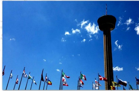
World flags fly high at the Tower of the Americas in San Antonio, TX.