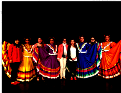
A delegation of International Visitors pose with Folkloric Dancers in San Antonio, TX.